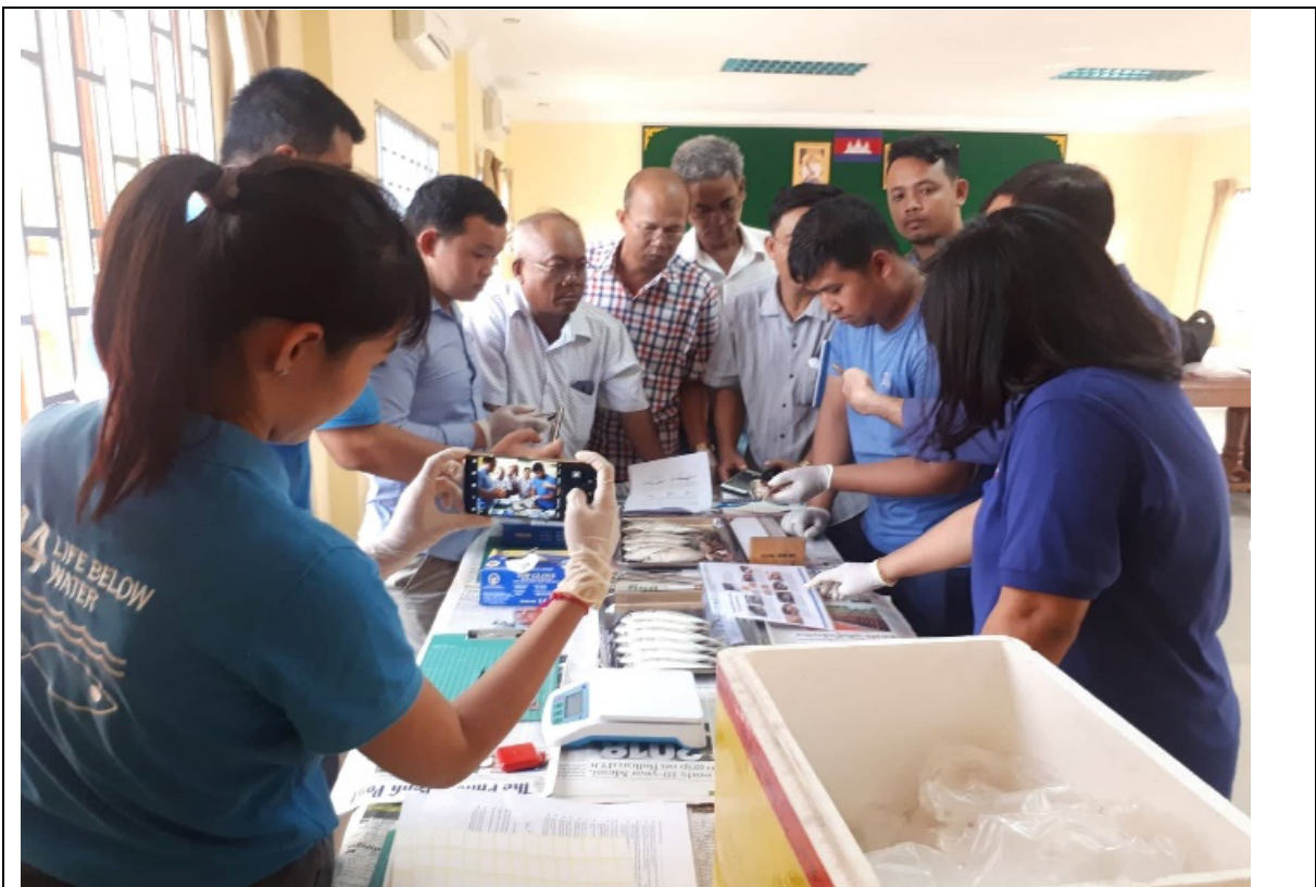
Technical Training on Biological Studies of Indo-Pacific Mackerel on 12-14 February 2019 in Koh Kong Province, Cambodia