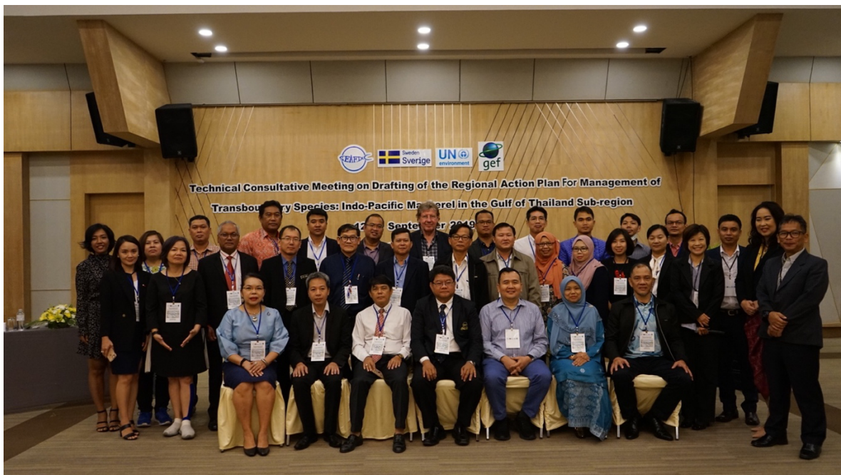
Regional Consultative Meeting on Drafting of the Regional Action Plan for Management of Transboundary Species, Indo-pacific Mackerel was held at Bay Beach Resort, Jomtien, Chonburi Province, Thailand (12th – 13th September 2019).

Although the information on migration patterns of Indo-Pacific mackerel within the country's EEZ in the Gulf of Thailand sub-region is already available for almost 30 years, however, the recent result from genetic analysis of Indo-Pacific mackerel using the individual assignment and mixed-stock analysis shows the contradictory migratory behavior of the species between the stock in the inner Gulf of Thailand and the stock in the eastern part of the Gulf of Thailand (Kongseng et al., 2020). Additionally, the population from Pattani Province may also migrate across the eastern Gulf of Thailand through the southern part of Viet Nam and Cambodia waters. Such results indicated that Indo-Pacific mackerel is transboundary species, and joint management cooperation at the regional or sub-regional levels among countries that harvested Indo-Pacific mackerel is necessary for sustainable management.